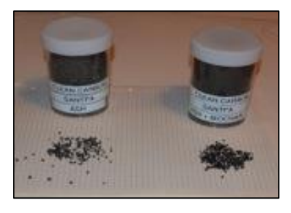
Above – (L) 100% ash and (R) 80% ash + 20% Biochar. The poultry litter ash was granulated into a flowable and low dust product suitable for application with cropping equipment.

There is still a knowledge gap in terms of assessing the value of poultry litter gasification ash as an alternative fertiliser in Australian cropping systems. The trial will need to be repeated and benefits will need to be clear before any investment is likely to be made in producing the product commercially in Australia.